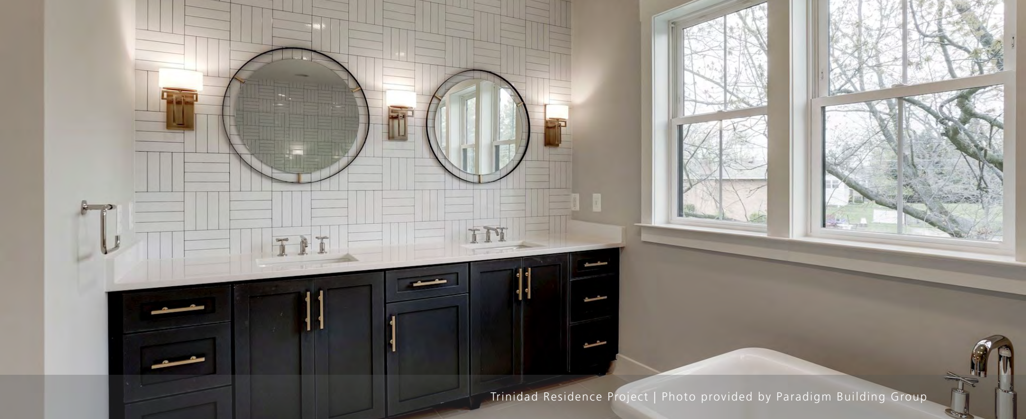
Trinidad Residence Project