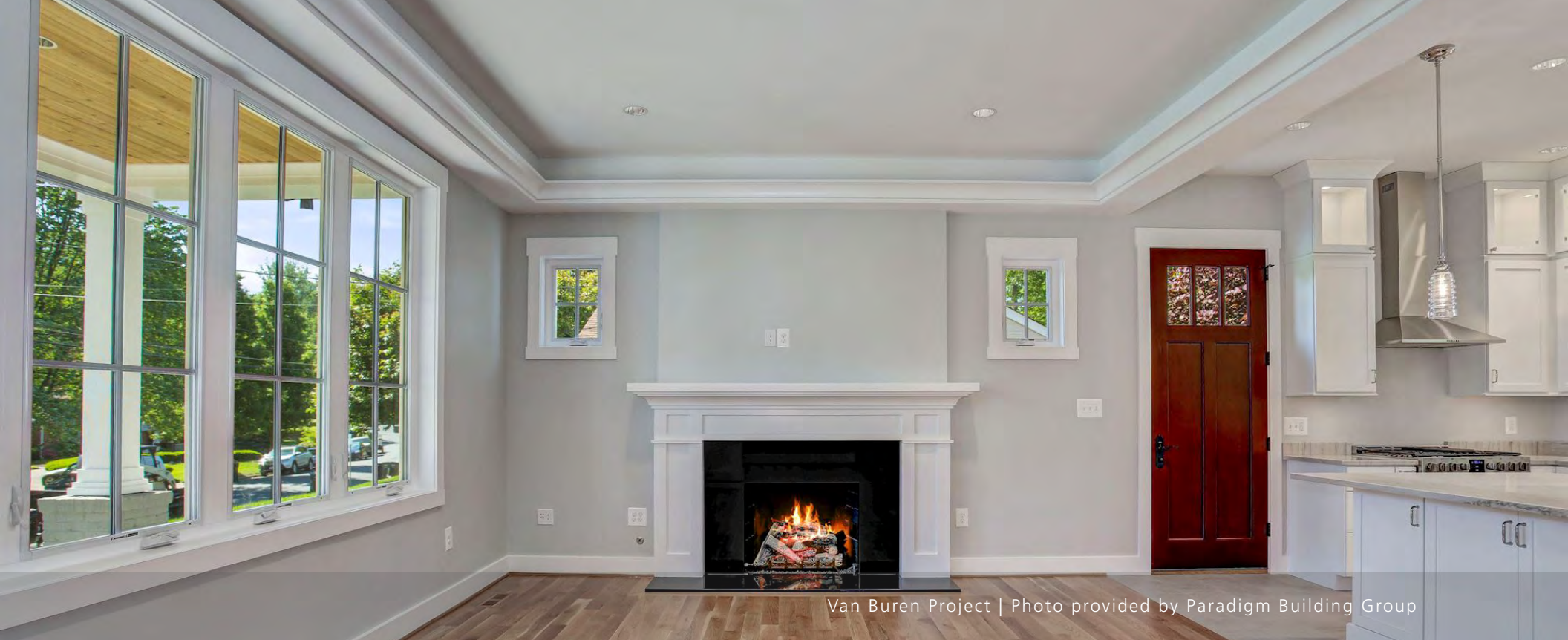
Van Buren Project