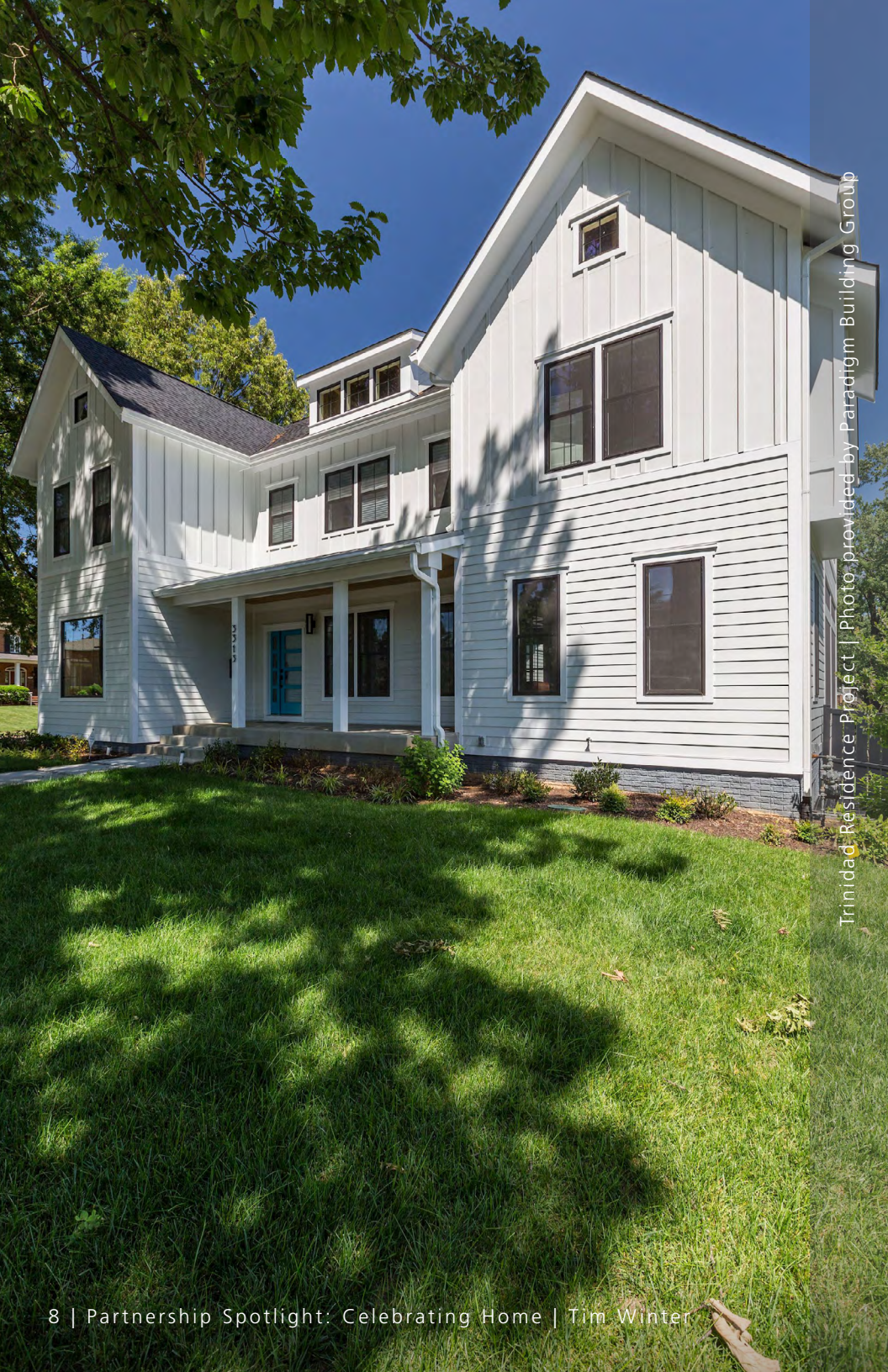
Trinidad Residence Project