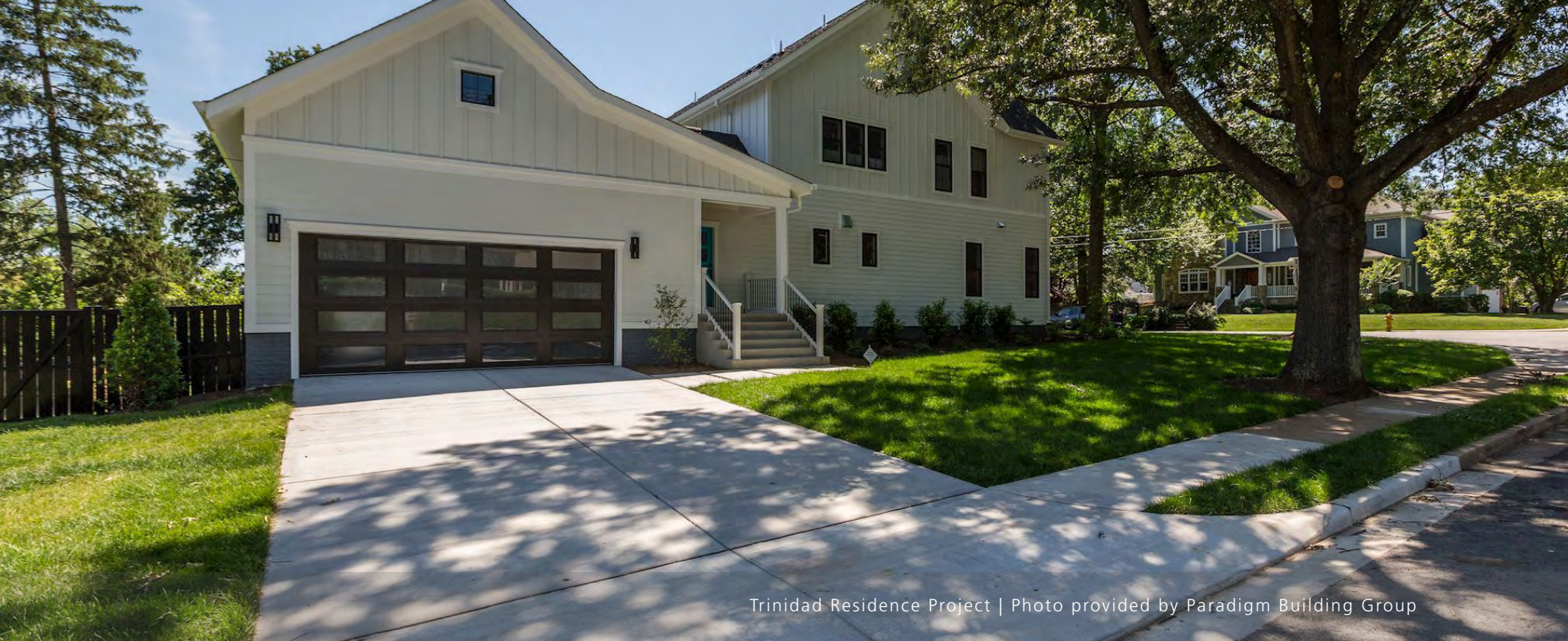
Trinidad Residence Project