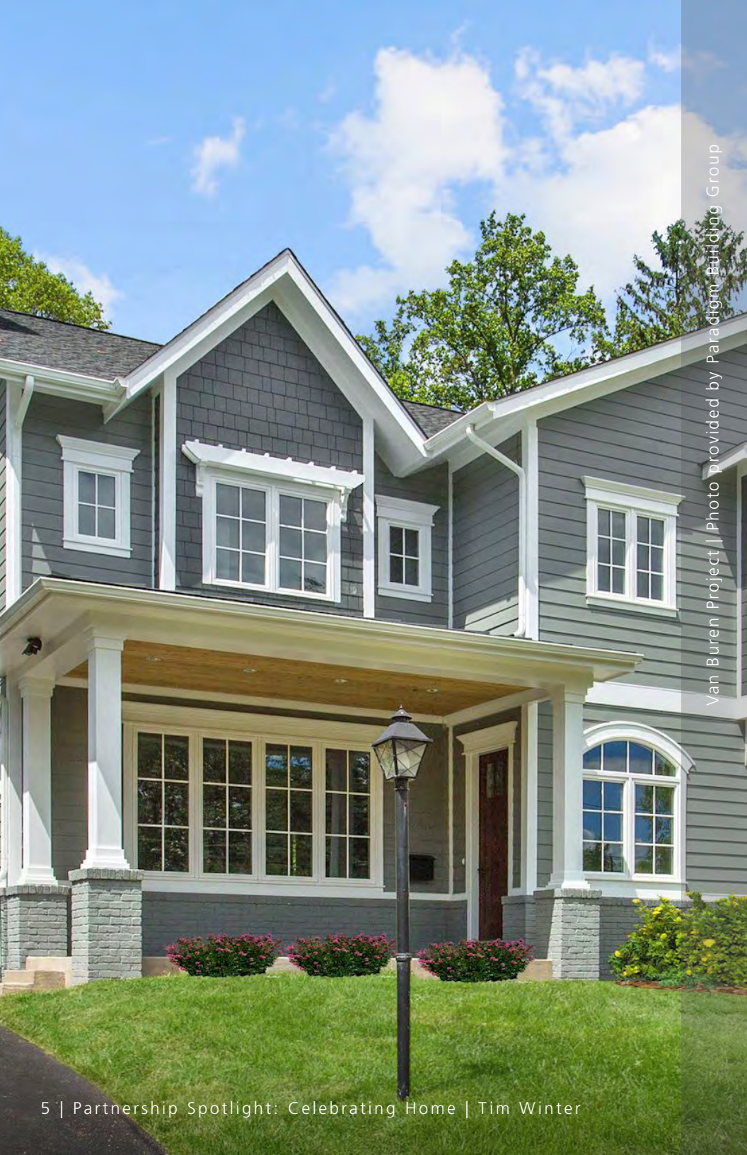
Van Buren Project