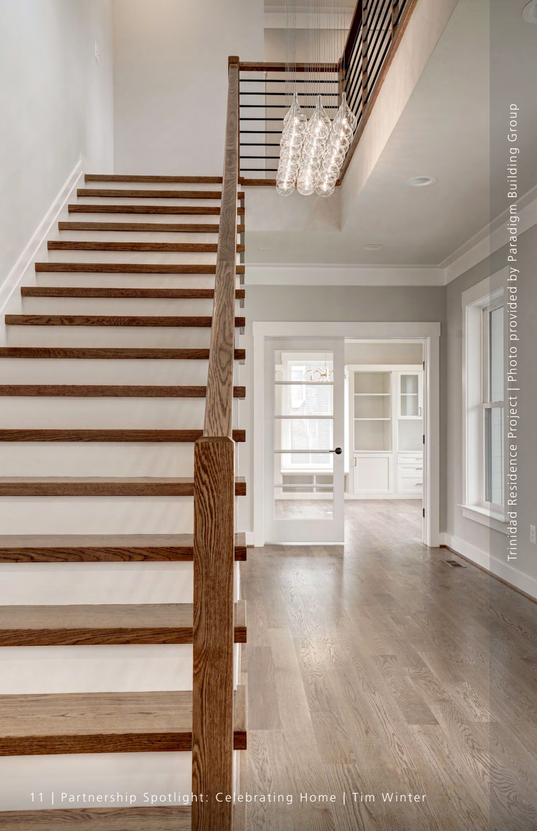
Trinidad Residence Project