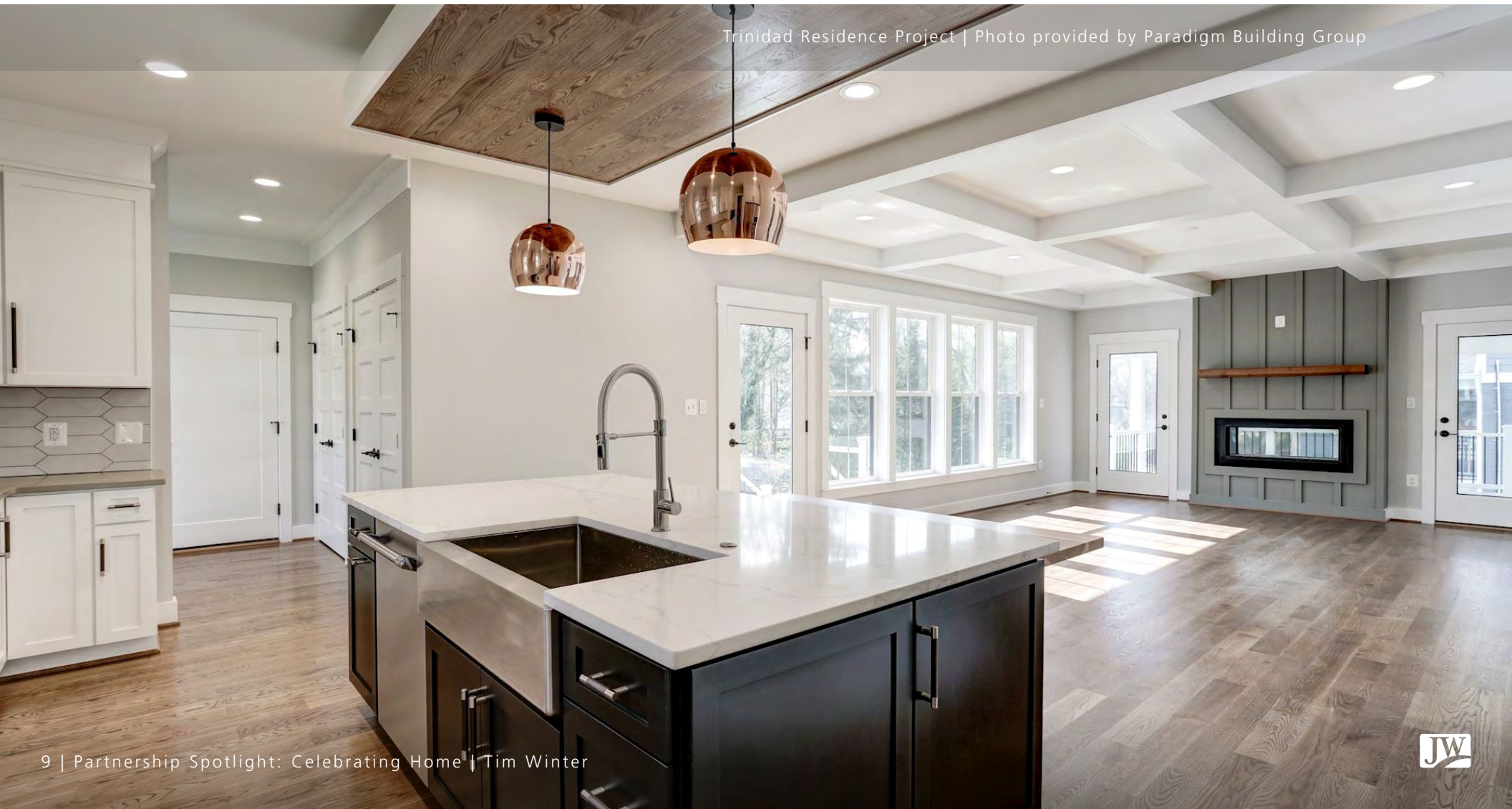
Trinidad Residence Project

The kitchen! It's where everyone congregates for hanging out and entertaining, and often where a lot of great memories are made.