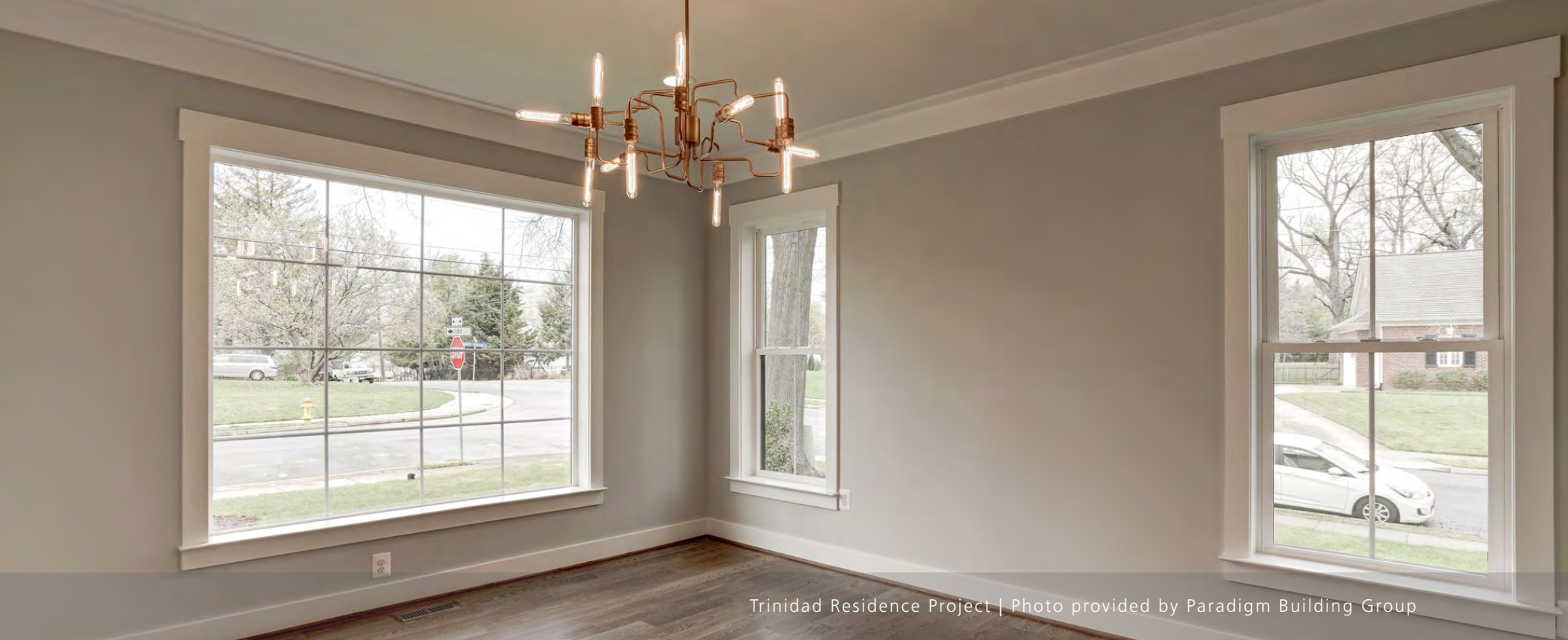
Trinidad Residence Project

Tell us about your experience with using JELD-WEN products. Which are your favorite, and what do you love about them?